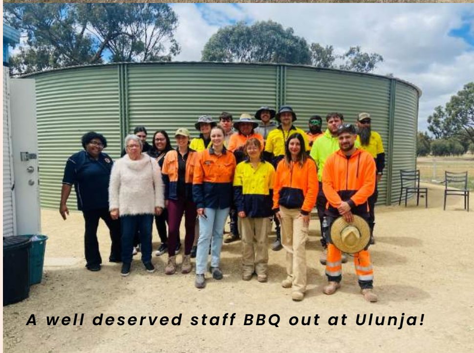
A well deserved staff BBQ out at Ulunja!

In the next twelve months, we will see these specially propagated tea-tree plants flowering. These flowers will produce high-grade nectar for bees to harvest in 2026! Very busy bees they will be!