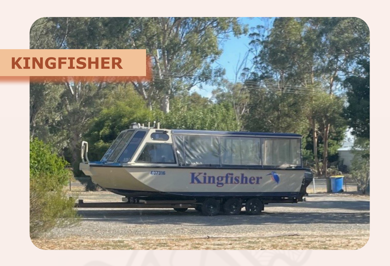
The Kingfisher ... where do we start!

We are happy to report that the Kingfisher has undergone all of her 'works' to now see her ready to go back onto the water. She has received her Survey for Commercial operations, undergone some minor repairs and been fully serviced.